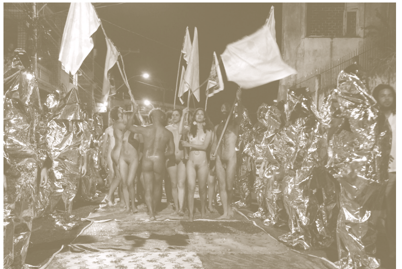
The Bahia Museum of Modern Art (MAM/BA) Bahia, Brazil