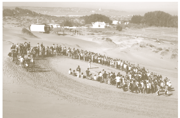
Open City of Amereida Ritoque, Chile